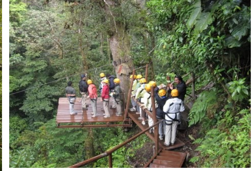
Tarzan, 21st century!

and study the behaviors of wild creatures in their